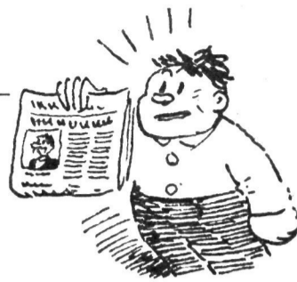
ILLUSTRATION BY MARC ROSENTHAL FOR THE WASHINGTON POST